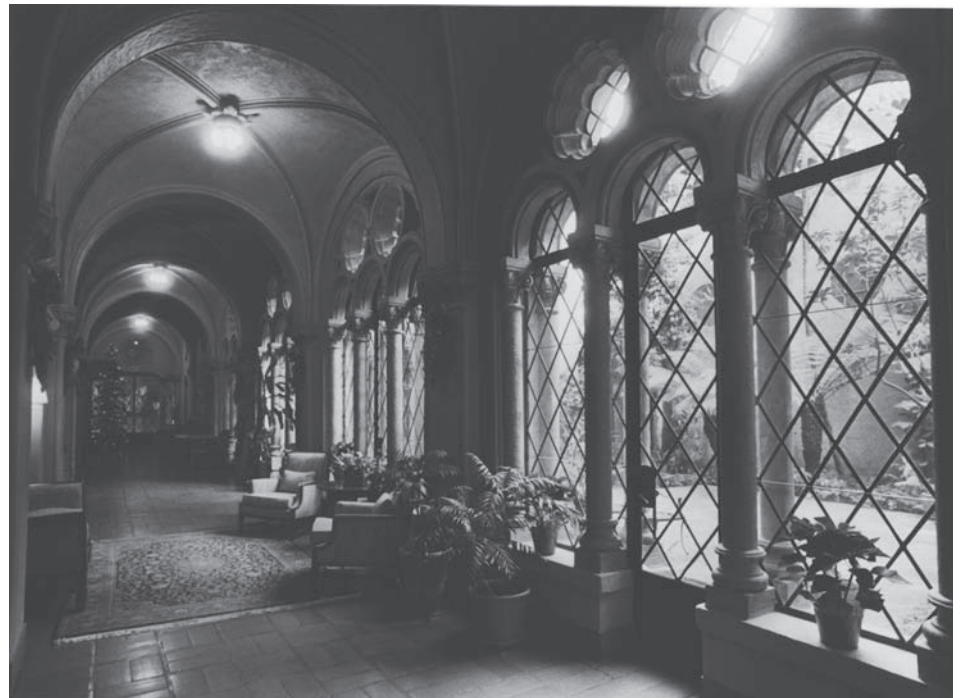
First Floor Gallery, circa 1950