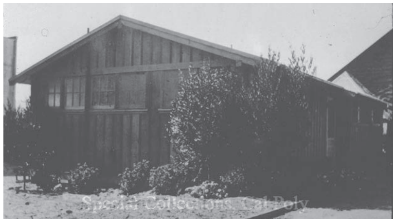
The House of Friendliness.

The Berkeley City Club Conservancy will soon be offering memberships. Watch your mail.