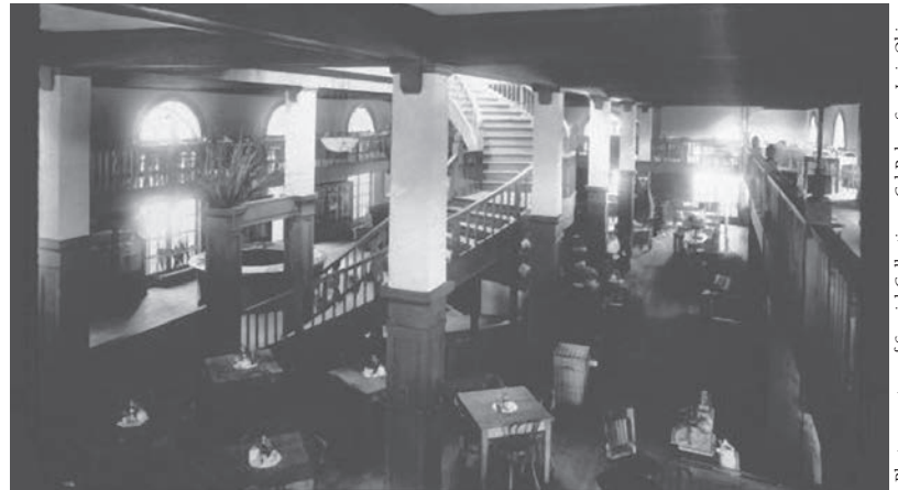
Interior view of the main YWCA building at PPIE.